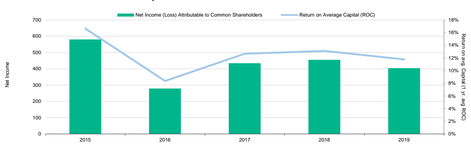
Exhibit 1 Net Income and Return on Capital